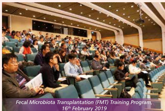
Fecal Microbiota Transplantation (FMT) Training Program, 16 th February 2019

On 5 th January and 16 th February 2019, TMC provided two-days training courses for the government. More than 300 healthcare providers have been certified to practise FMT in their clinical practices. According to Taiwan FMT Consensus and FMT Special Regulation, two FMT centres were set up at Chang Gung Memorial Hospital in July and Taipei Veterans General Hospital in September, respectively.