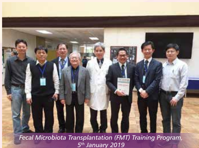
Fecal Microbiota Transplantation (FMT) Training Program, 5 th January 2019

In March 2017, Professor Chun-Ying Wu invited more than 300 experts to establish Taiwan Microbiota Consortium (TMC). TMC aims to establish platforms to promote microbiota study and collaboration.