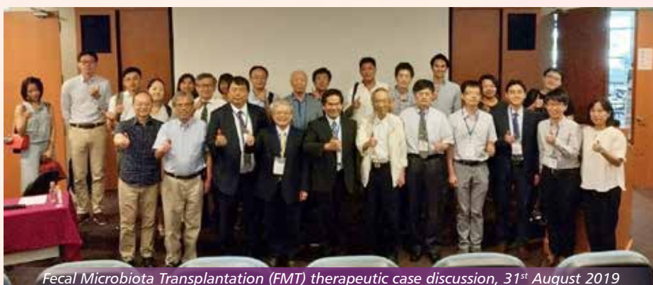
Fecal Microbiota Transplantation (FMT) therapeutic case discussion, 31 st August 2019