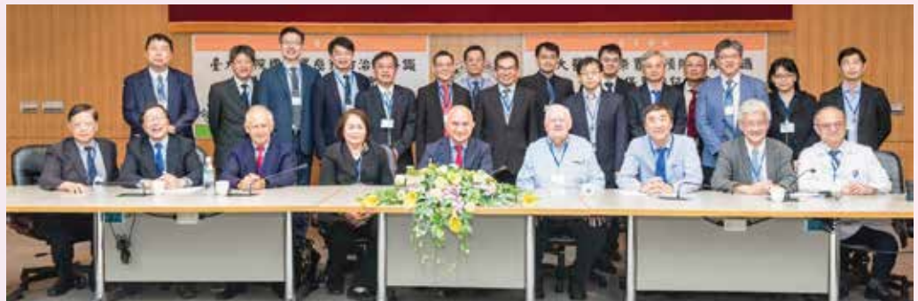
International Gastric Cancer Prevention and Treatment Consensus and the World Stomach Day took place at National Taiwan University Hospital, with doctors and scholars around the world in attendance.

After the APTC, a consensus meeting was held in Taipei on 30 th September and 1 st October 2019. A consensus was reached on 26 statements with regard to the strategy of screening and eradication of H. pylori for gastric cancer prevention. The experts also highlighted several unresolved issues that deserve future collaborative researches. They proposed two international collaborative researches on the updated prevalence of H. pylori in Asia-Pacific regions and the application of molecular markers for risk stratification of gastric precancerous lesions. The experts also called for more research programmes to address on these unresolved issues for gastric cancer prevention.