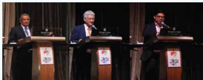
The Past and Future of the MSGH