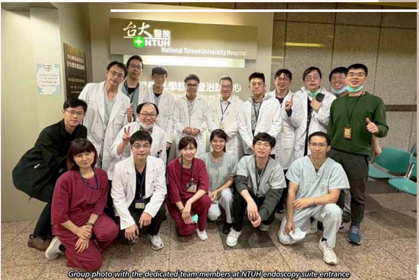
Group photo with the dedicated team members at NTUH endoscopy suite entrance

On reflection, this fellowship rests upon the foundation laid during my earlier training. I remain deeply grateful to my mentors in Malaysia from Hospital Kuala Lumpur, Hospital Selayang, Hospital Sultanah Bahiyah, and