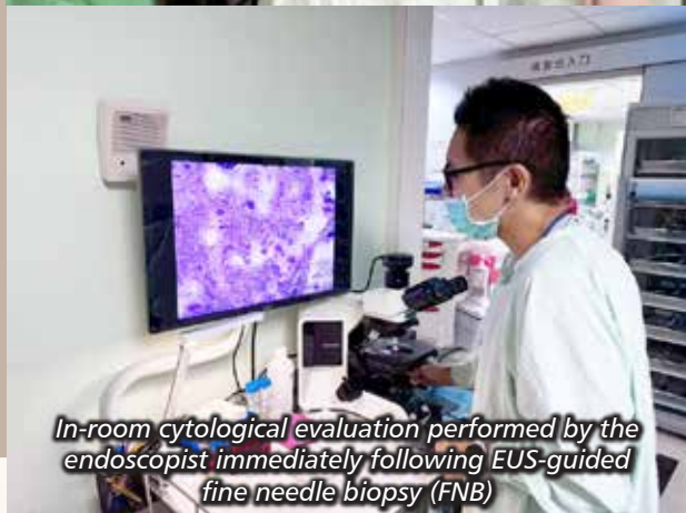
In-room cytological evaluation performed by the endoscopist immediately following EUS-guided fine needle biopsy (FNB)

EUS-guided gastrojejunostomy, variceal coiling, and gallbladder drainage. ERCP exposure included technically demanding procedures such as double-balloon enteroscopy-assisted ERCP, endoscopic papillectomy, difficult biliary stone management, and treatment of benign and malignant biliary strictures, including post-liver transplantation cases. I also observed fluoroscopy-guided oesophageal and colonic stenting. My mentors provided detailed explanations of procedural indications, technical considerations, and decision-making strategies, greatly enriching the learning experience.