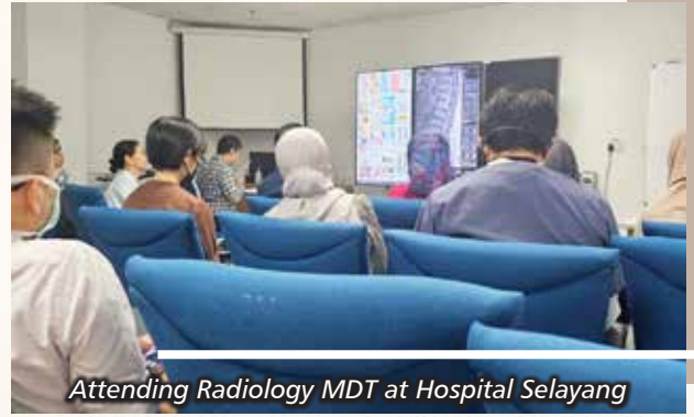
Attending Radiology MDT at Hospital Selayang