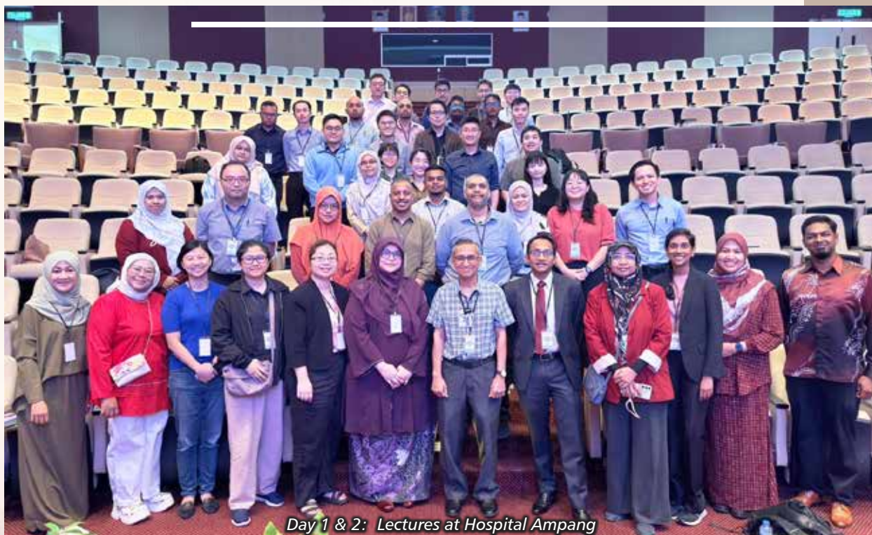
Day 1 & 2: Lectures at Hospital Ampang