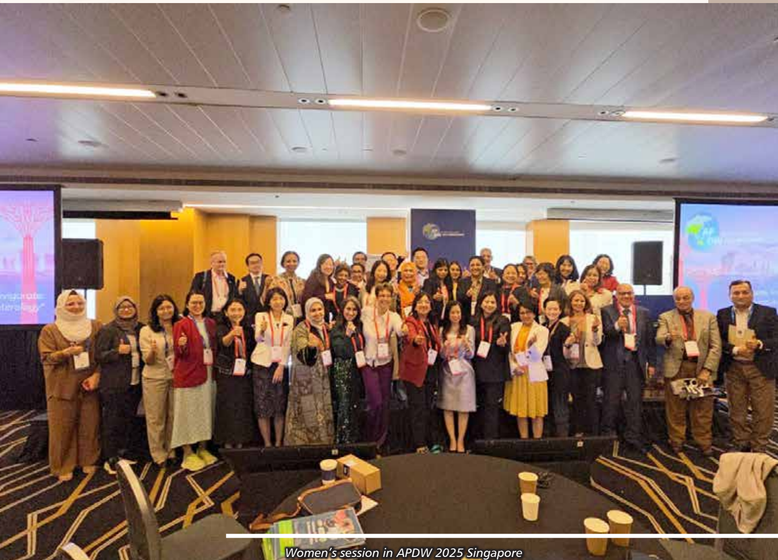
Women's session in APDW 2025 Singapore

Despite this progress, disparities in academic representation and authorship persist in many parts of the world. Recent discussions in the literature, including a recent editorial in the Journal of Gastroenterology and Hepatology , have highlighted that while the visibility of women in gastroenterology is improving, gender parity in research authorship and academic leadership still has some distance to go.