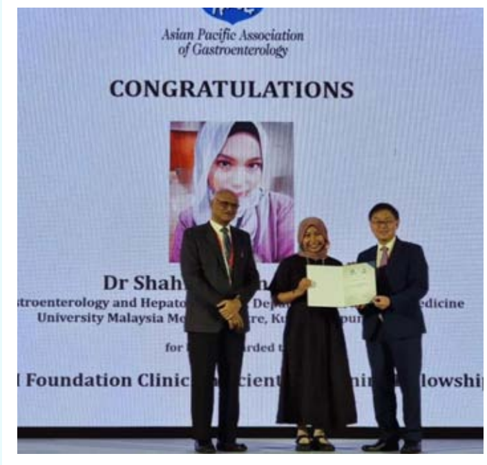
APAGE-JGHF Clinical Scientist Training Fellowship Award presentation at APDW 2023 in Bangkok, Thailand

During my time at SVHM, I attended and participated in the weekly IBD clinic and gained experience in using both first-line and second-line advance medical therapy for treatment in IBD, and managing IBD patients with