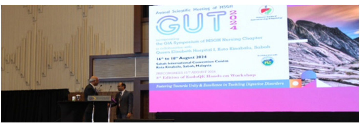
GUT meeting held at the Sabah International Convention Centre, Kota Kinabalu, Sabah