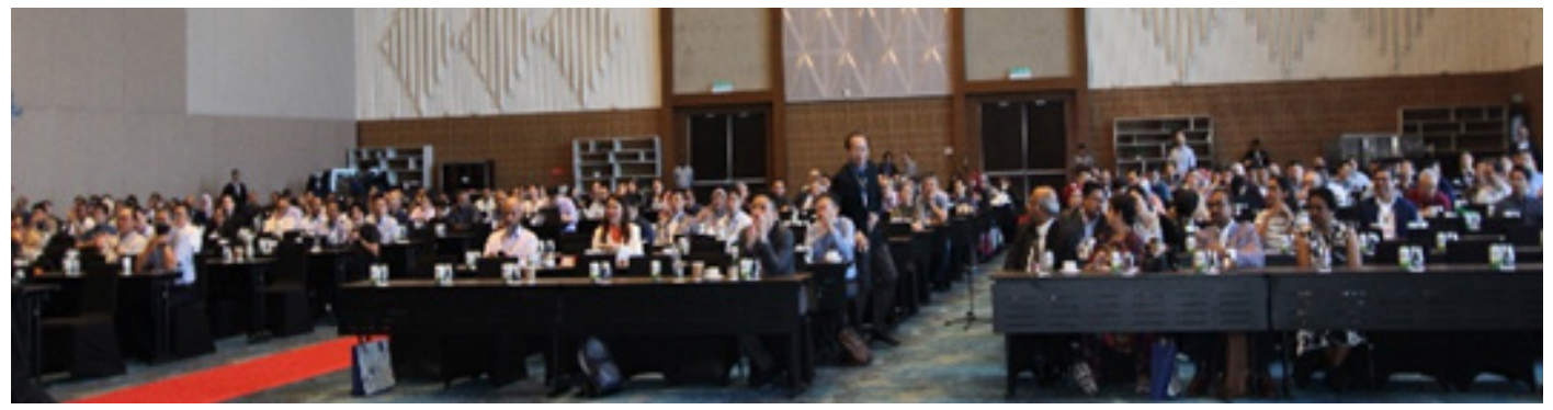
Attendees at GUT 2024