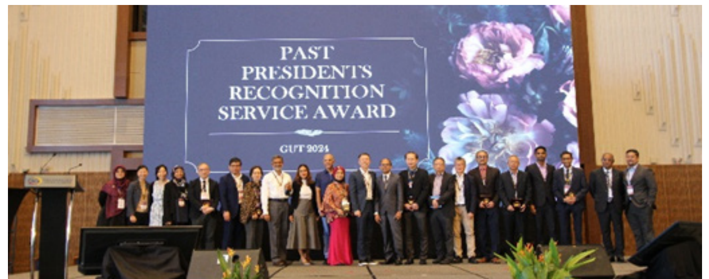
Past Presidents with the MSGH Executive Committee