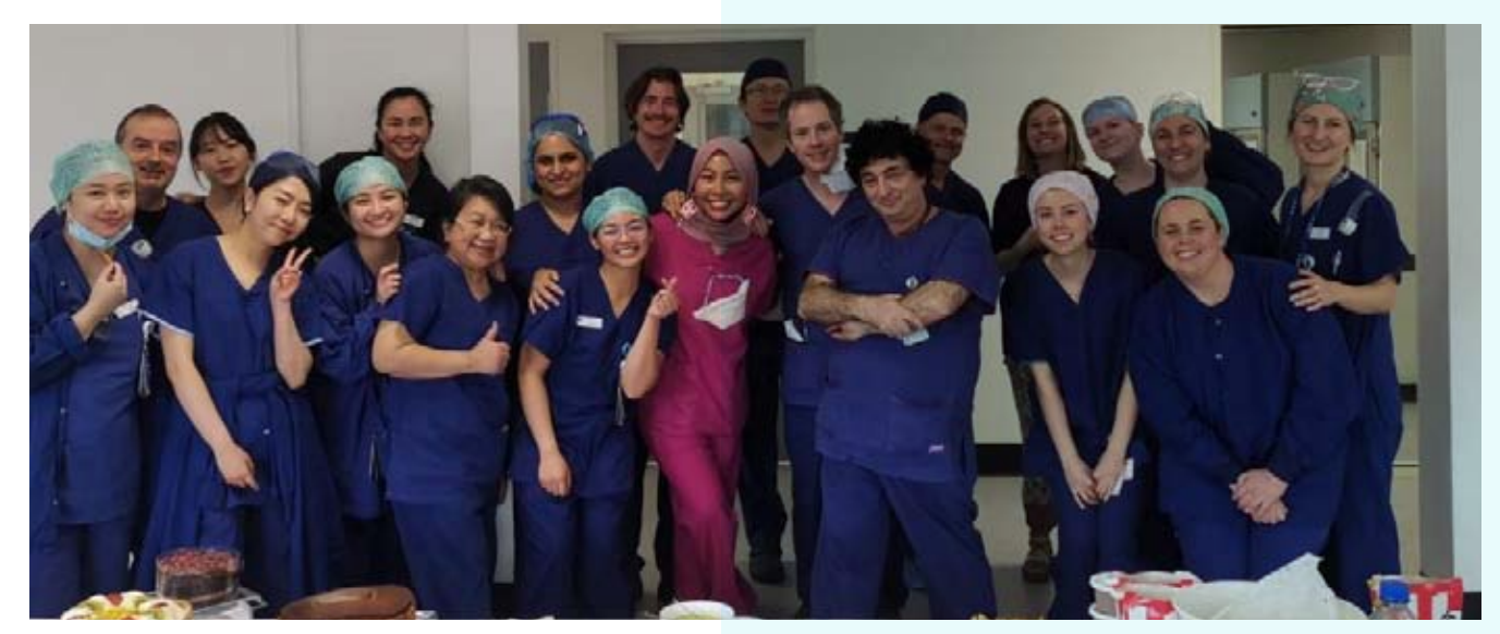
With the St Vincent's Hospital On the Park staff

Specifically, an analysis on their centre's early experience with selective JAK inhibitors in IBD was a topic I was looking into. I had also conducted a prospective quality assurance study under the guidance of my supervisor, with the aims of developing an algorithm in the treatment of acute severe ulcerative colitis, including